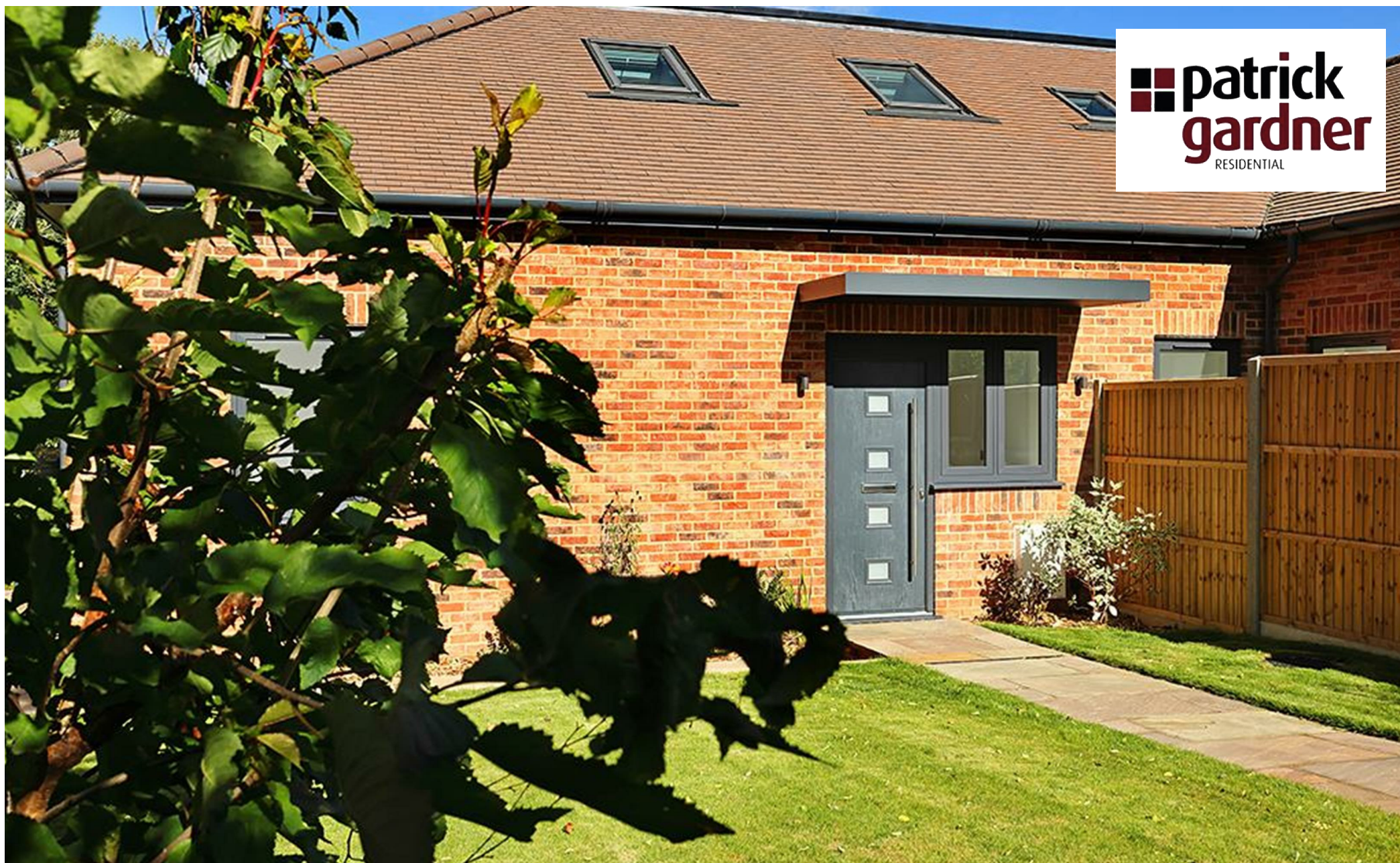
Plot 2 Kennel Close, Fetcham, Surrey, KT22 9PF