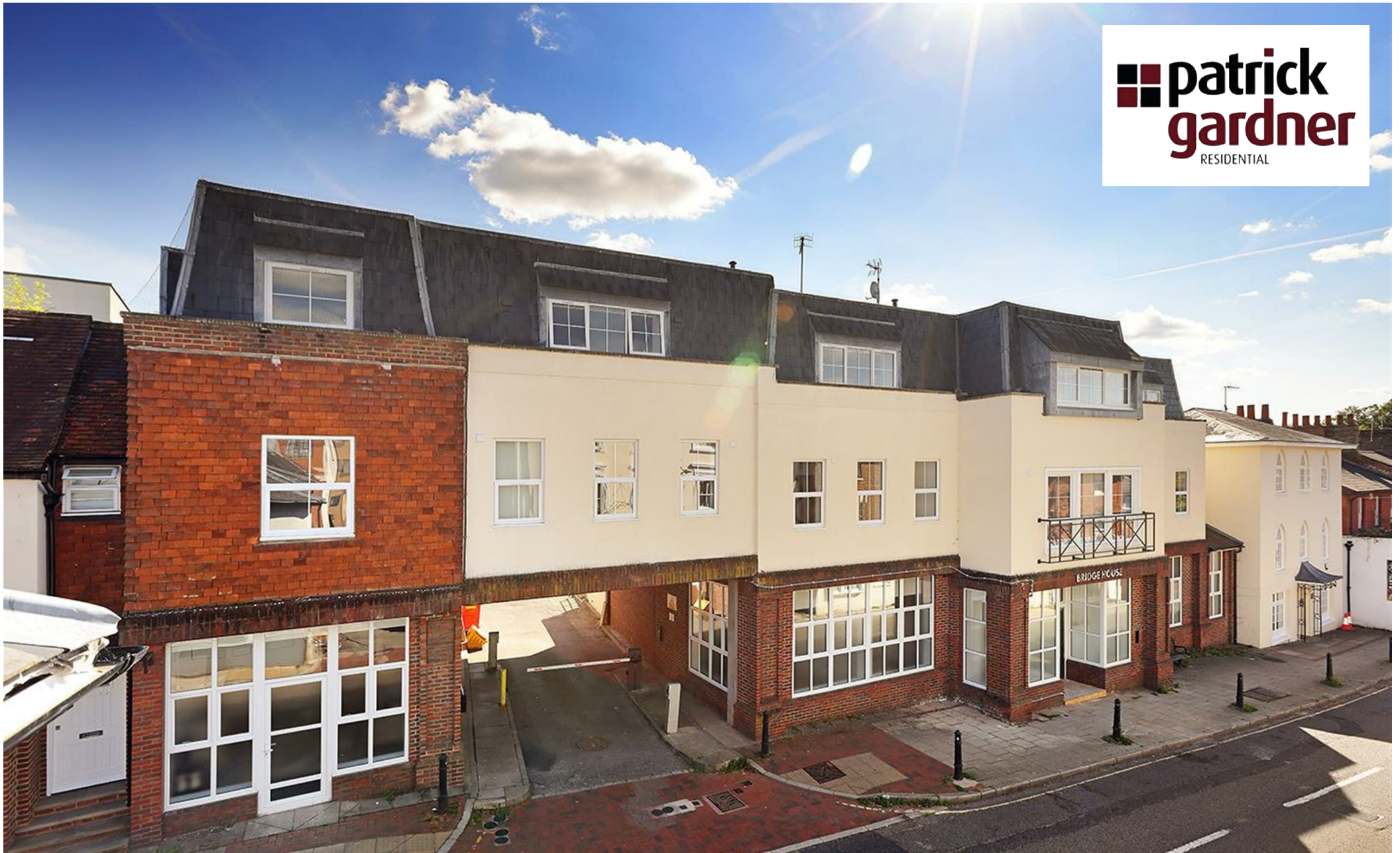
21, Bridge Street, Leatherhead, KT22 8HE