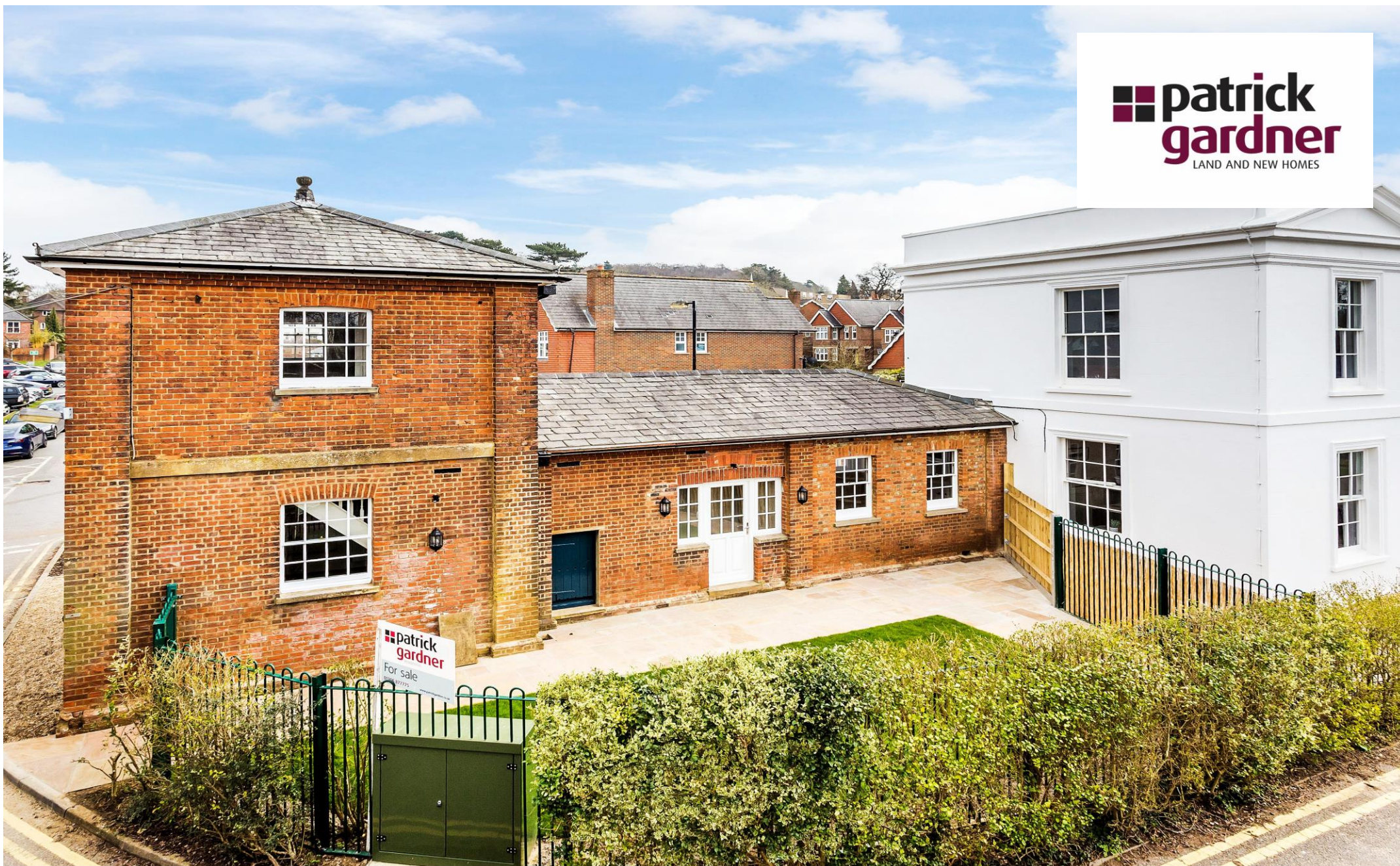
1 Shearburn Lodge , Downsview Gardens, Dorking, Surrey RH4 2AA