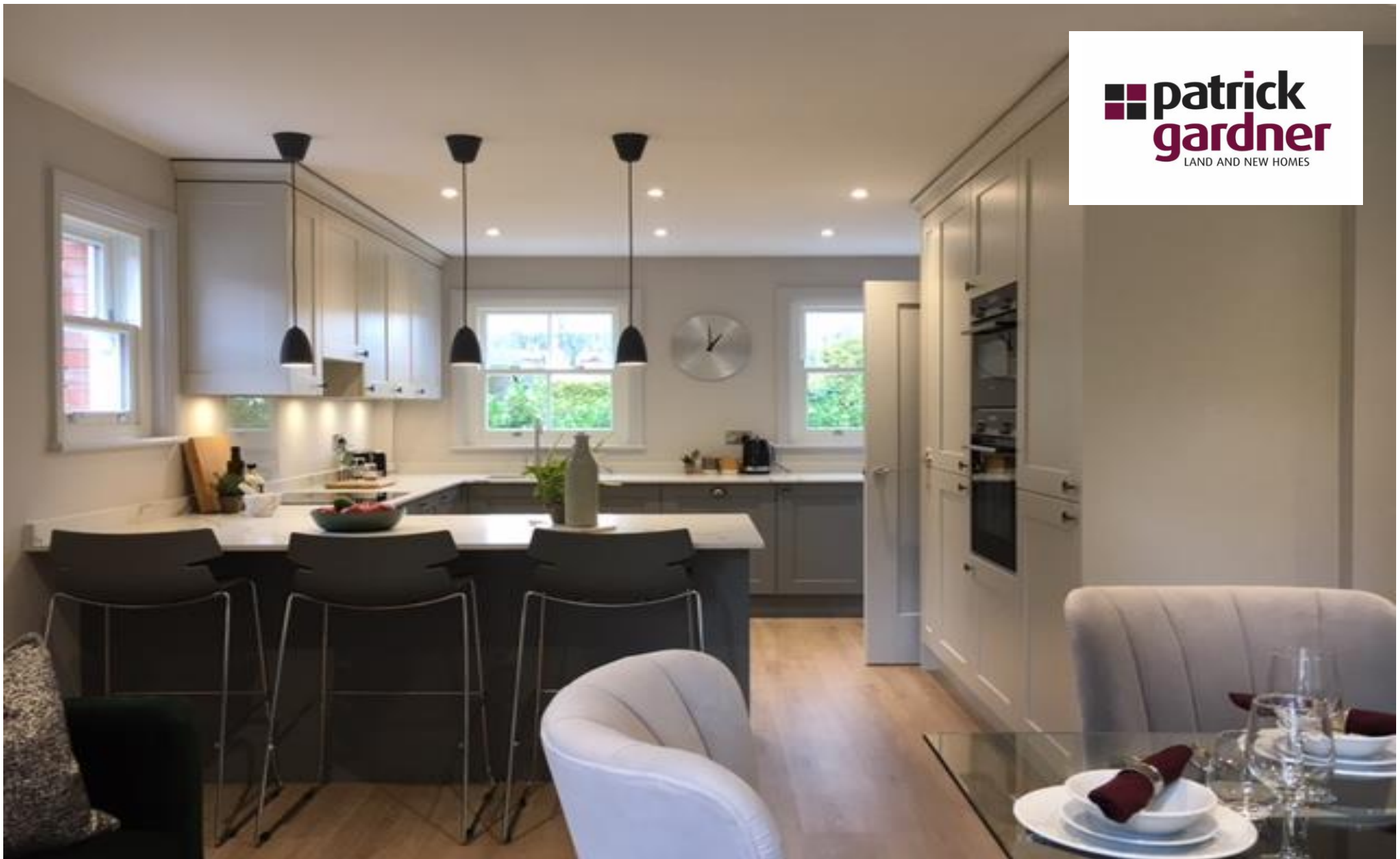
The Elms , 1 Garden Hill, Westcott, Dorking RH4 3NJ