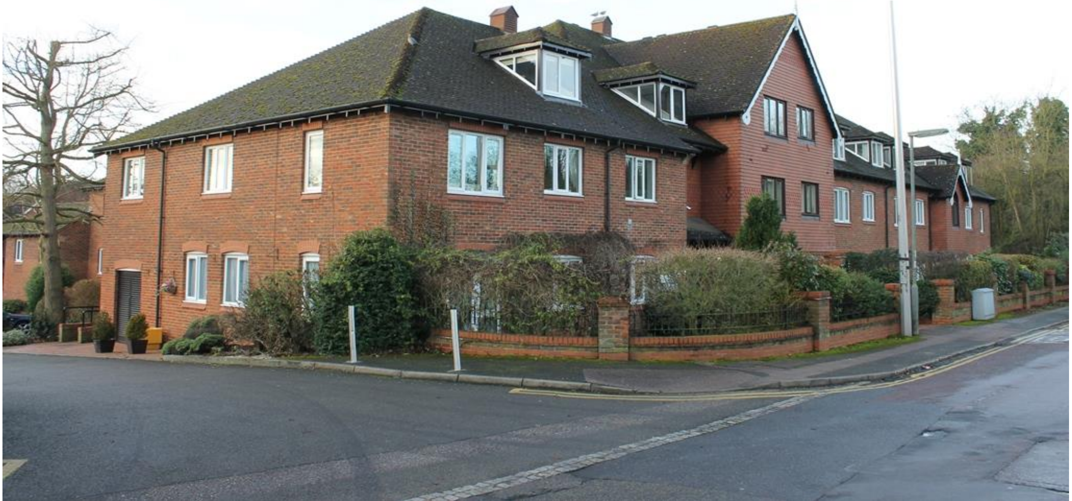
Holly Court , Belmont Road, Leatherhead, Surrey KT22 7DX